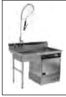
Optional dishtable, faucet and pre-rinse unit sold separately.