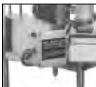
Optional Temp-Sure™ heater assures a continuous supply of 140°F hot water that guarantees excellent results.