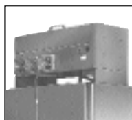
Top mounted controls include built-in chemical pumps and delimiting system that assures proper chemical usage.