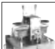
Bowl option available for capsule dispensed products.