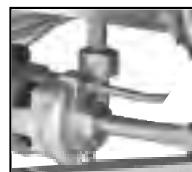
Pump purging system improves results by eliminating soil and chemical carryover during rinse cycle.