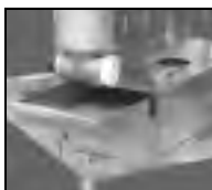
Integrated scrap tray prevents food soil from entering drain system.